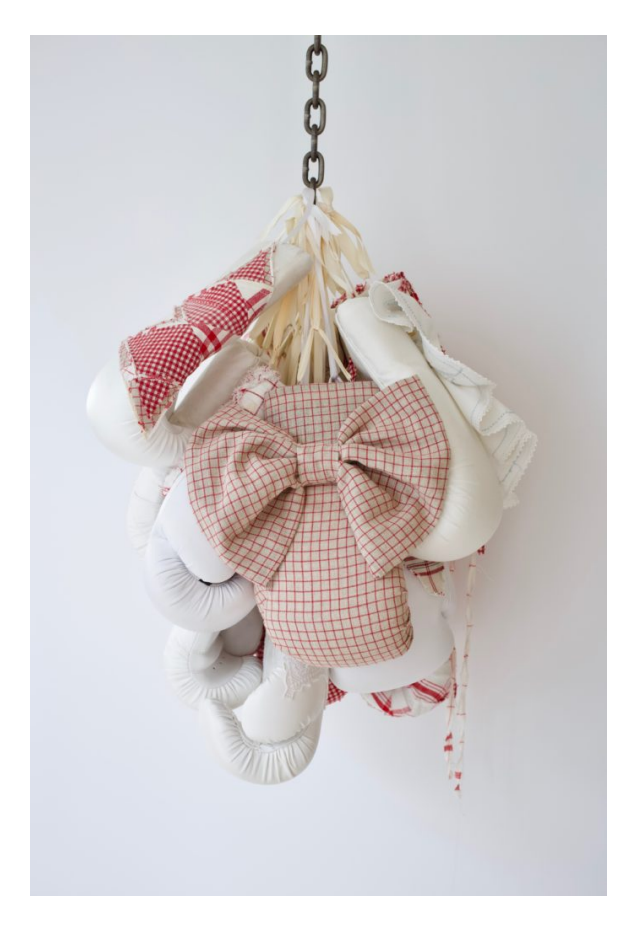
Zoë Buckman, Tight Rooted (2019).