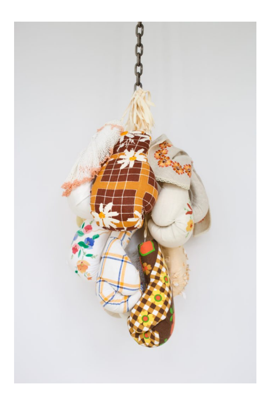
Zoë Buckman, According to Grandma (2019).