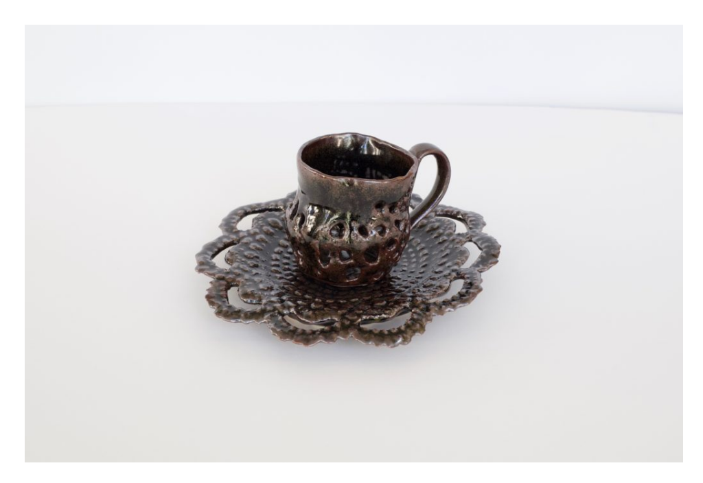
Zoë Buckman, Like Marmite on Matzos (2019).

"For the glazes, I wanted to use colors that would speak to bruising and bleeding, and that's actually quite a lot if you think about it," Buckman added. "Blue, black, green, red, purple, pink... it was a process of experimenting with a bunch of different glazes and I narrowed it down to about four."