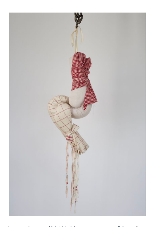
Zoë Buckman, Banter (2018).