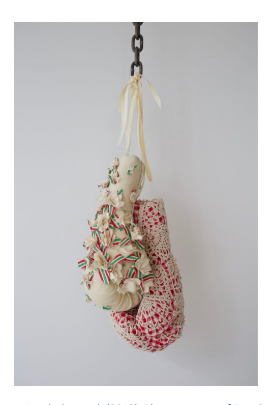
Zoë Buckman, Londesborough (2018).