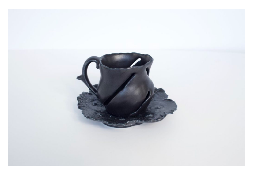
Zoë Buckman, Squish Squish (2019).