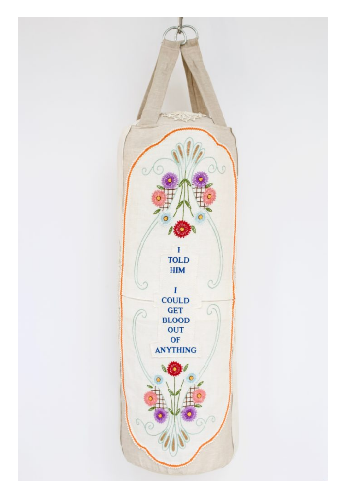
Zoë Buckman, Heavy Bleach (2019).

The works in "Heavy Rag" started with a set of tea towels Buckman took back from her mother's house, and quickly grew from there. She was inspired by the fabric works of Louise Bourgeois, but also by a childhood spent growing up around the kitchen. "We didn't have a fancy dining area. It was just everyone around this big wooden kitchen table."