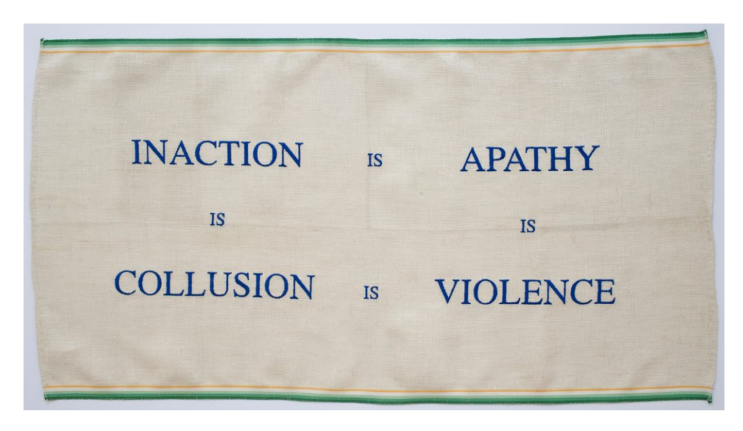
Zoë Buckman, Inaction II (2018).