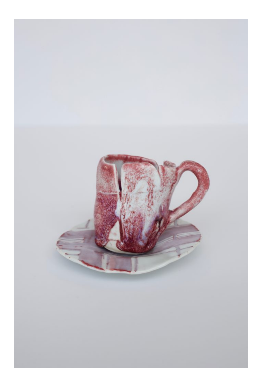
Zoë Buckman, The Fucking Master (2019).