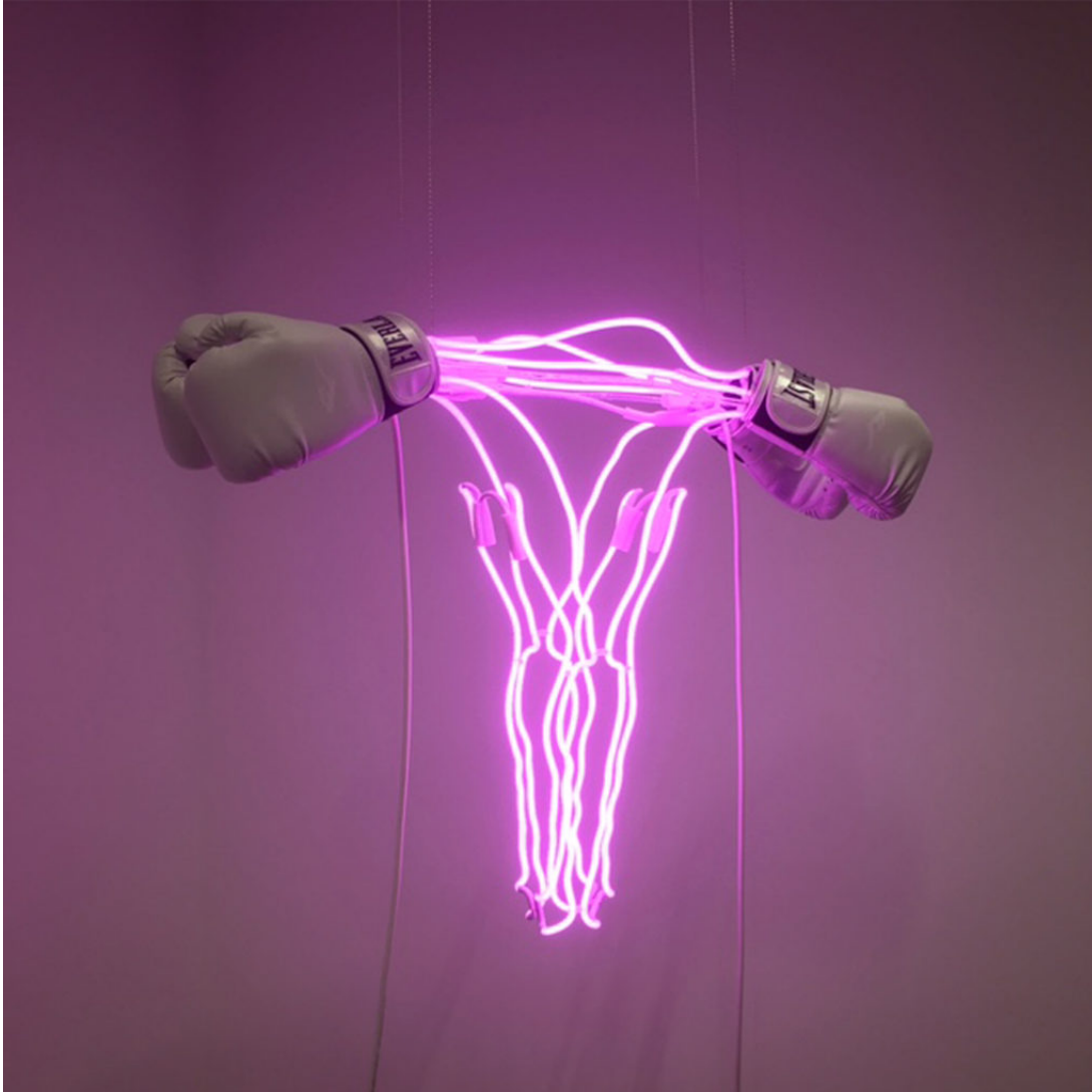
Champion , 2015, from the same series.