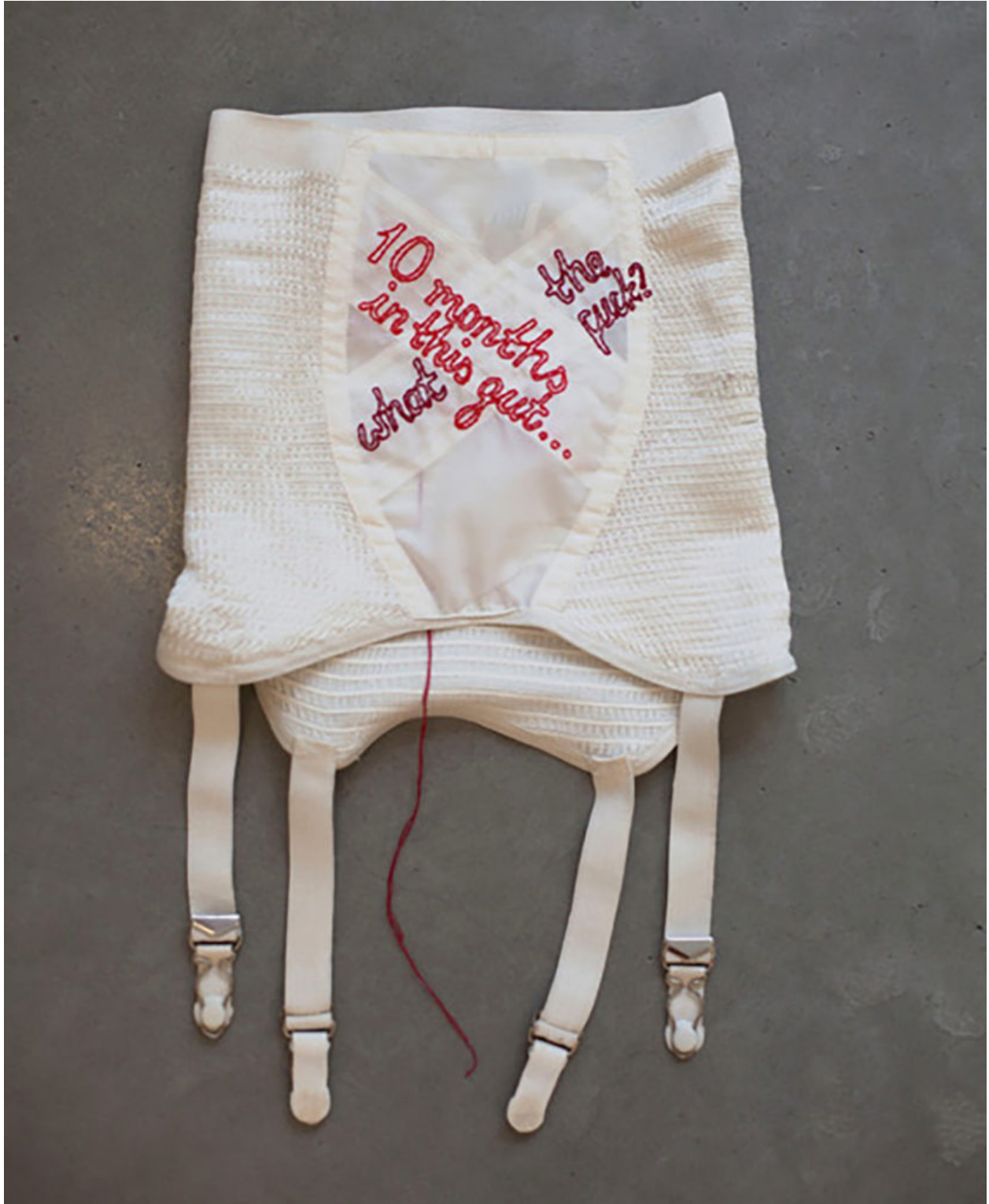
10 Months In This Gut, Every Curve, 2015.

our sexuality and our sexual appetite. All of these things I think have been sort of swept under the carpet in all facets of our society.