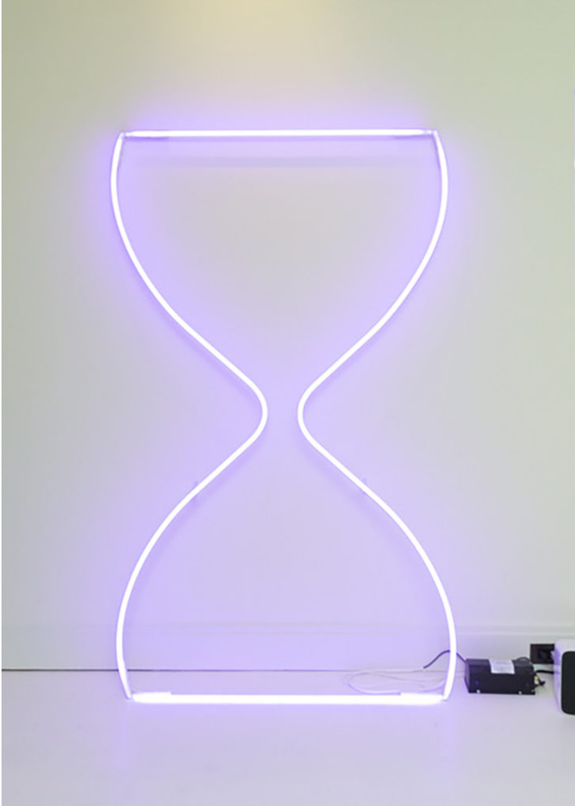
Time's Up, 2017.