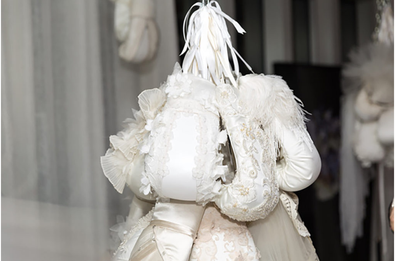
Wakeful Anguish from the series “Let Her Rave,” 2017.