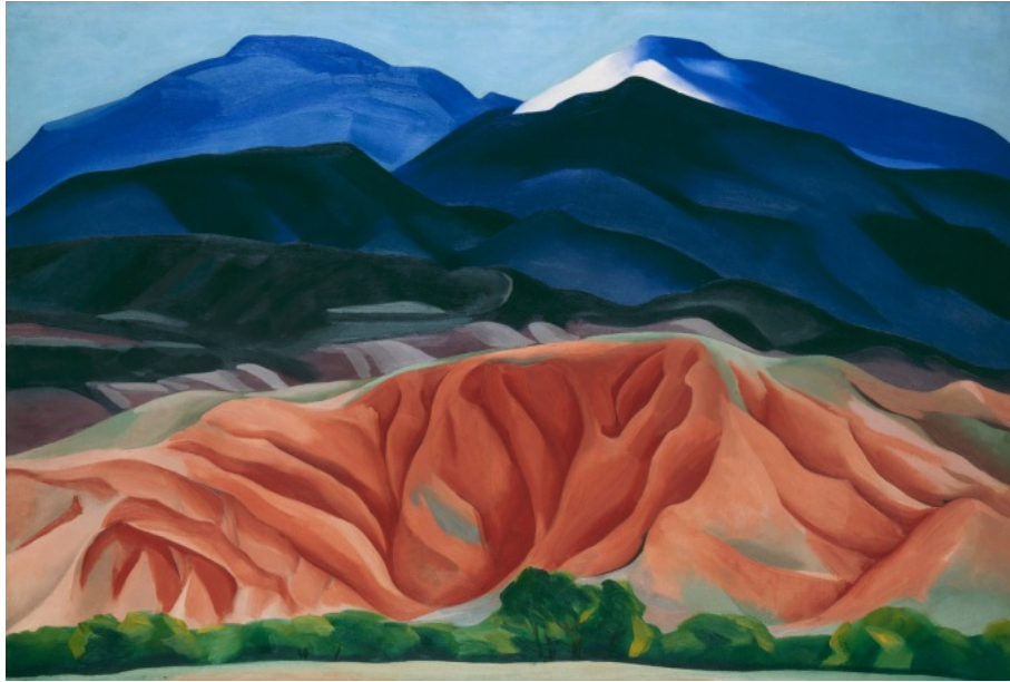
Georgia O'Keeffe, Black Mesa Landscape, New Mexico / Out Back of Marie's II (1930).

"Action Research: The Stagecraft of Power" will be on display from March 17–May 22, 2016.