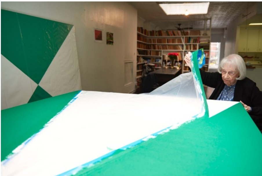
Carmen Herrera at work on a painting.

“ Laura Poitras: Astro Noise ” is on display from February 5–May 1, 2016.