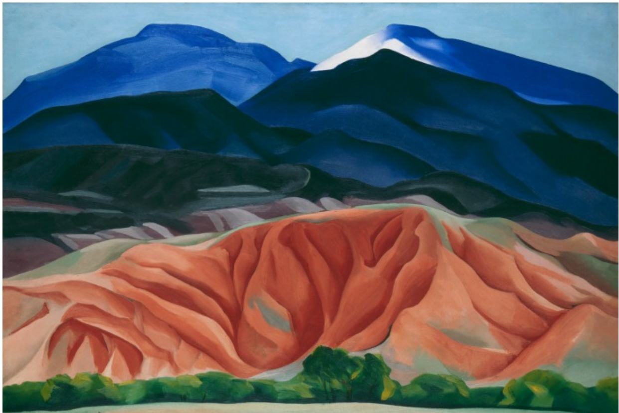
Georgia O'Keeffe, Black Mesa Landscape, New Mexico / Out Back of Marie's II (1930).

In honor of International Women's Day, get excited for these shows.