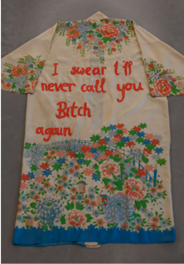
Zoe Buckman, "bitch again." embroidery on vintage lingerie.