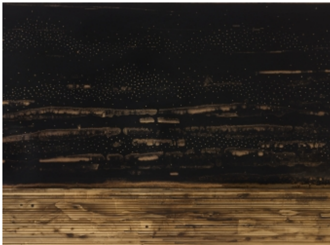
Teresita Fernández.

"Georgia O'Keeffe" will be on display from July 6–October 30, 2016.