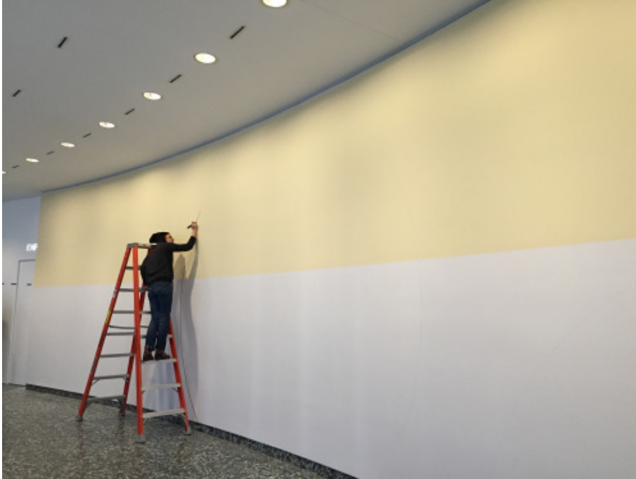
Linn Meyers.