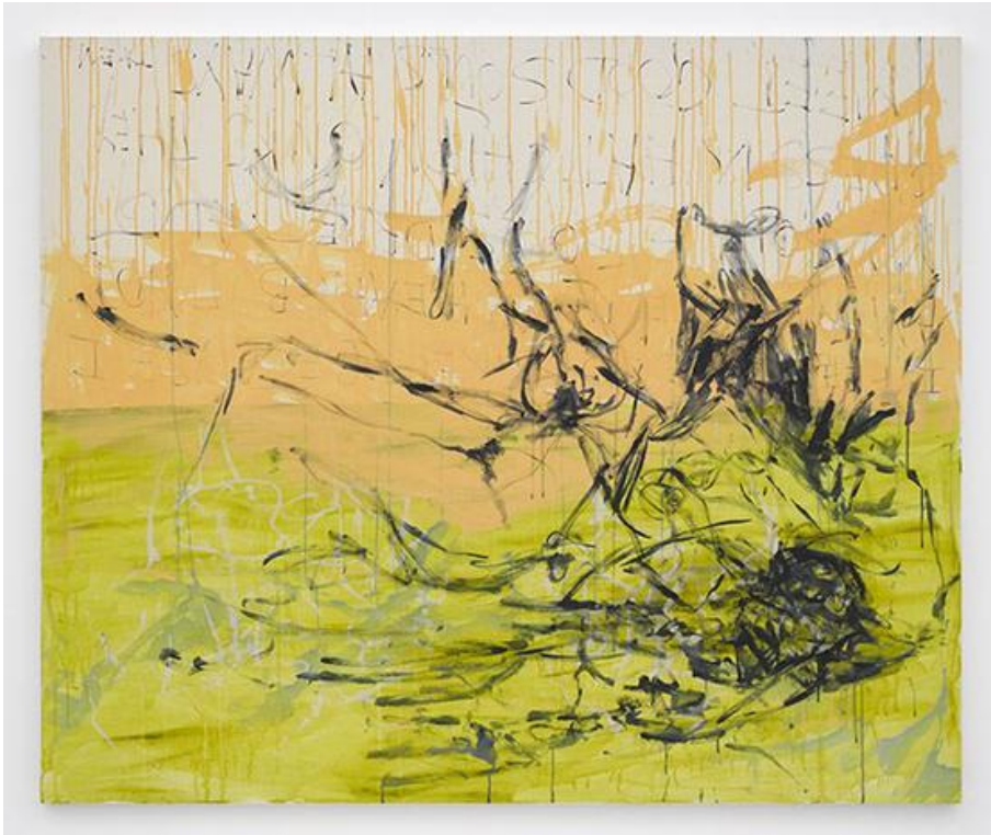
Tracey Emin, I tried to hold your soul (2015).

"Teresita Fernández " will be on display from April 20–May 26, 2016.