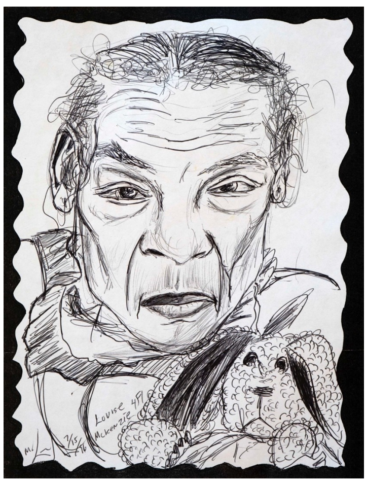
Michelangelo Lovelace, Louise McKenzie, 1996, 8.5 x 11 in, Ink on paper

A man in the background appears to be asleep, another man to the right of him is scratching his face, a couple to the right again might be talking, but perhaps in murmured tones — you can imagine the television being the loudest thing in the room. Disjointed and subdued the Day Room might seem, but in fact it's just the opposite: Lovelace brings these disparate figures together with vibrant blues and yellows, hastily hatched net curtains beaming like party streamers.