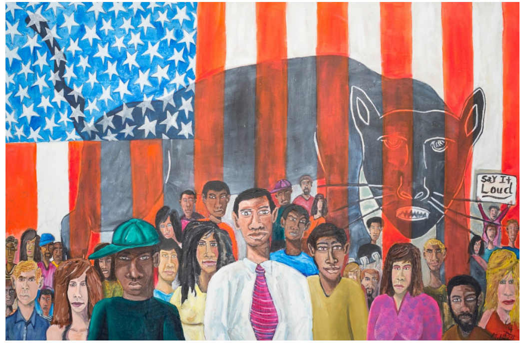
Michelangelo Lovelace, American Panther, 2016, 40 x 60 in, Acrylic on canvas

Nursing homes are a vulnerable place to be at the best of times. But now more than ever. Care homes have proved coronavirus incubators and sadly account for a staggering share of the death toll in both the UK and the US. It's time we confronted our biases — both personal and systemic — towards the elderly. Fort Gansevoort's online Nightshift exhibition is the perfect place to start.