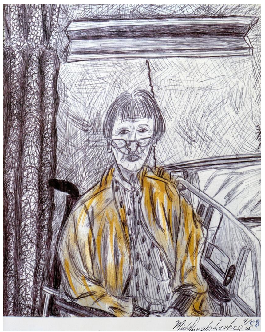
Michelangelo Lovelace. Untitled, 2008. Ink and marker on paper. 11 \times 8.5 in.

These records of eye-to-eye exchange are complemented by scenes of the nursing homes' tiled halls and private living quarters where daily life takes place in a state of permanent quarantine. While strikingly medical and filled with the emblems of dwindling health, these incredibly detailed works burst with intricate patterns pressed up to the picture plane. Thickets of lines seem to convey layers of unseen energy and information, underlining a sense that the residents in these drawings have interior lives as active as their physical lives are still. A woman with breathing tubes reads intently in her bed, a man by a window observes the bustling city below from his wheelchair. Lovelace renders such precise moments with exquisite honesty.