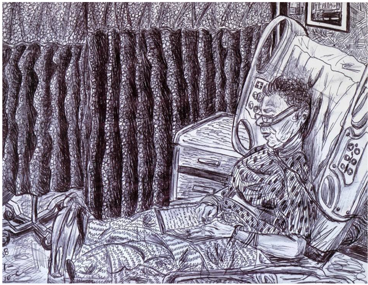
Michelangelo Lovelace, Untitled , 2008. Ink one paper. 8.5 x 11 in.