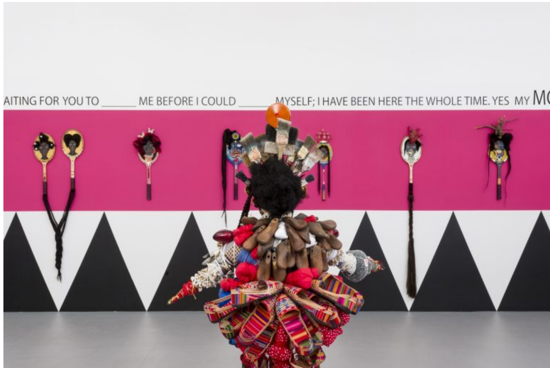
Installation view, Şlang: Short Language in Soul

Together the figures become a tribe of women. Although made from discarded material, they are colorful and assertive, standing strong to ward off the evils of contemporary society. German's powerful works are modern day deities created from the refuse of everyday life.