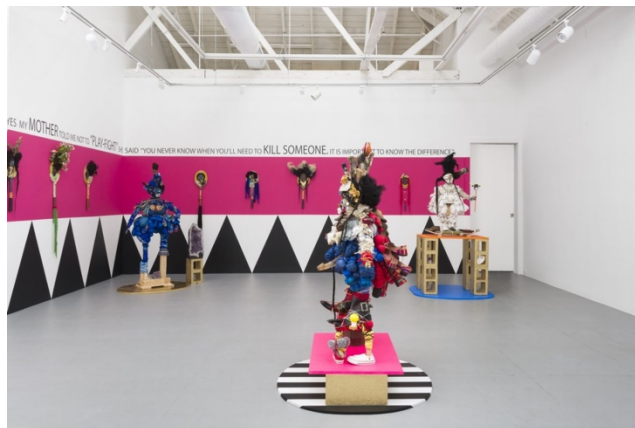
Installation view, $lang: Short Language in Soul

Although German's works share affinities with Alison and Betye Saar , as well as with Nick Cave as all of these artists create elaborate sculptures with found materials that examine the African diaspora, black identity, race and power, German also examines folk arts' relationship to spirituality in addition to drawing from personal experiences and observations.