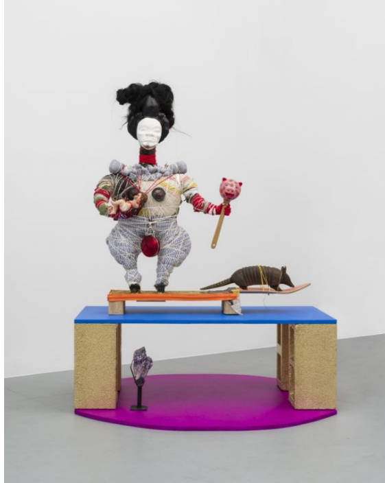
A Physical History of Grace

The figure in A Physical History of Grace holds a small 'white' infant doll in one arm and a stick with a pig's head in the other. A white painted mask serves as her head, which is surrounded by tufts of dark hair. Two ceramic breasts extend from the center of her body which is otherwise clothed in striped and patterned fabrics all bound with white string. A large red light hangs between her legs and a wooden armadillo rests on a skateboard to her left. On her back she wears a sign that reads "no admittance."