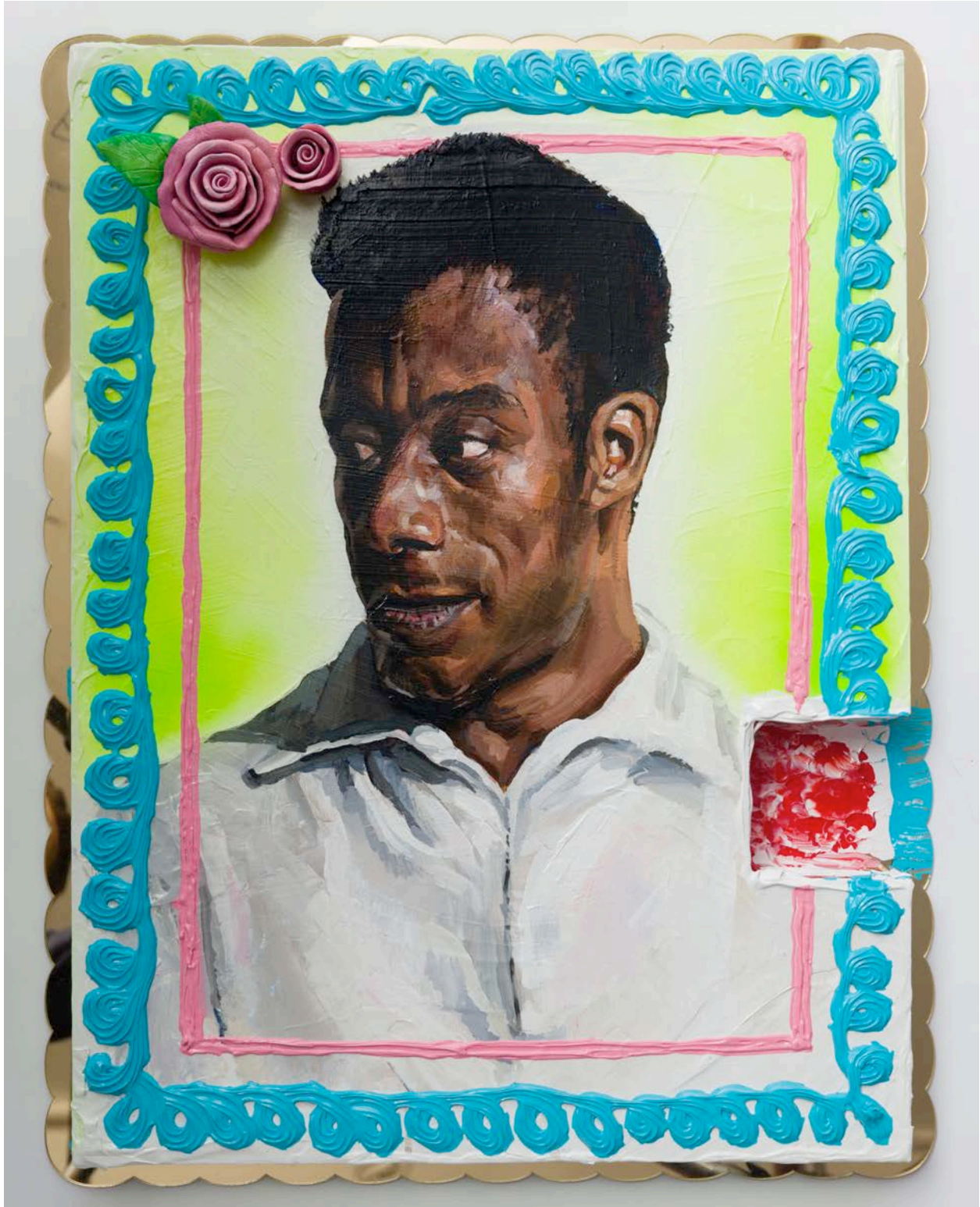
A Red Velvet Cake For A Native Son (James Baldwin), 2018