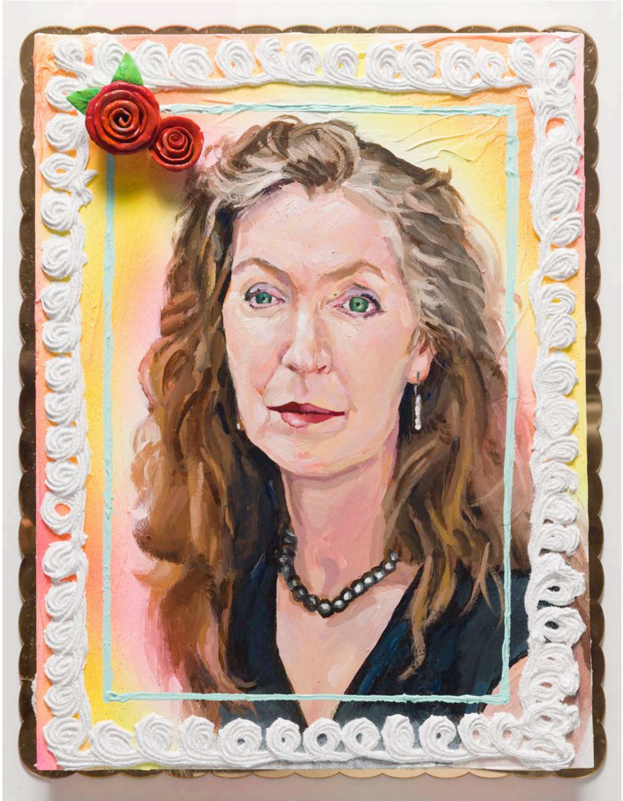
Rebecca Solnit cake, 2018