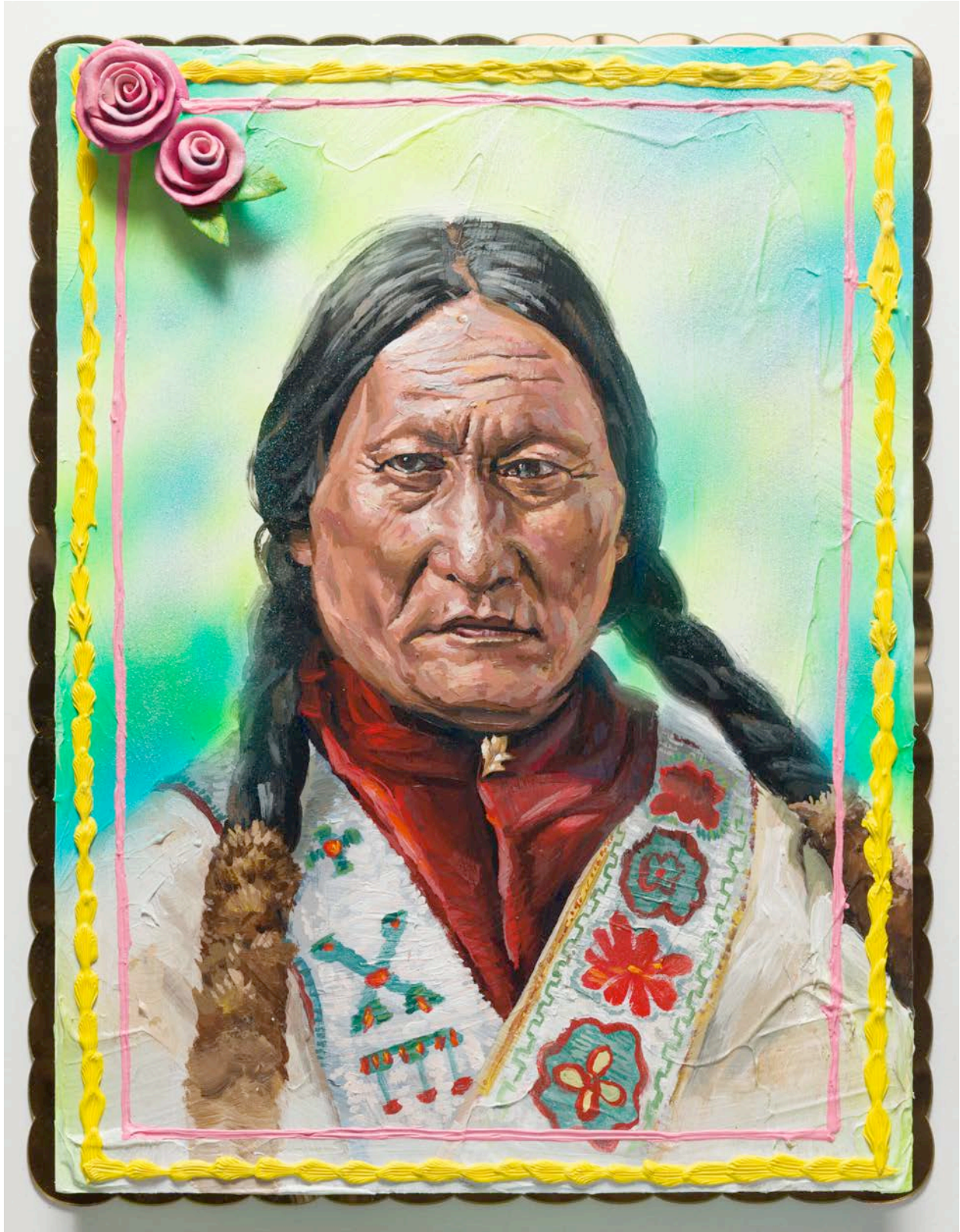
Sitting Bull cake, 2019