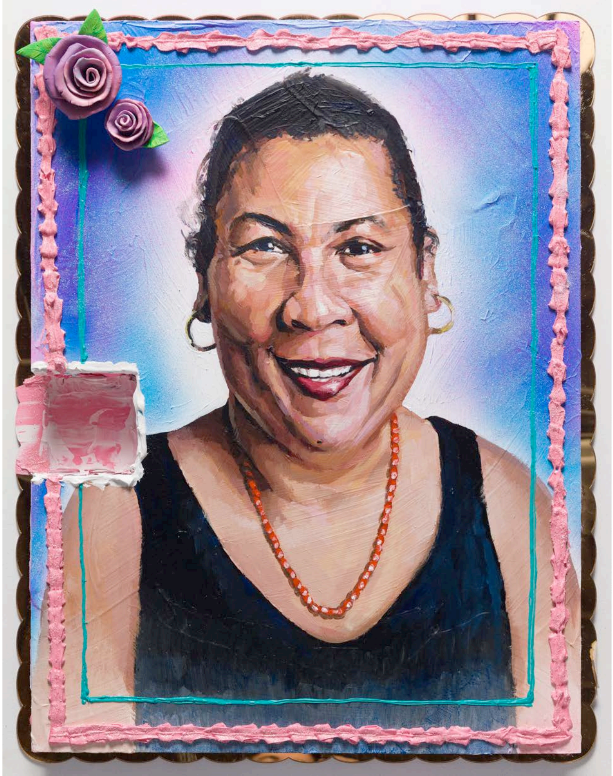
bell hooks cake (2018)