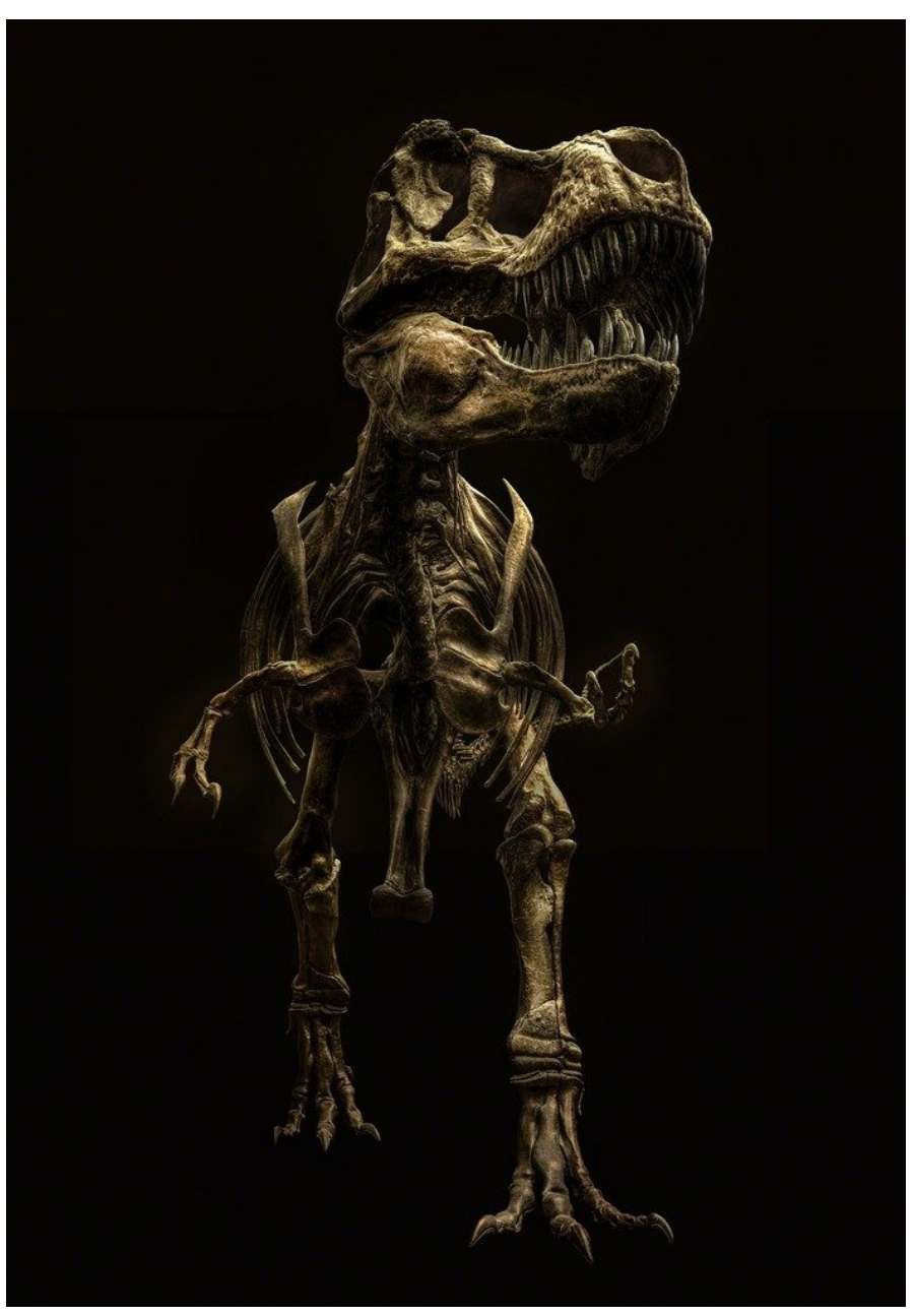
Christian Voigt, Tyrannosaurus Rex (2018).

" Christian Voigt: Evolution " at Unix Gallery March 7–April 6