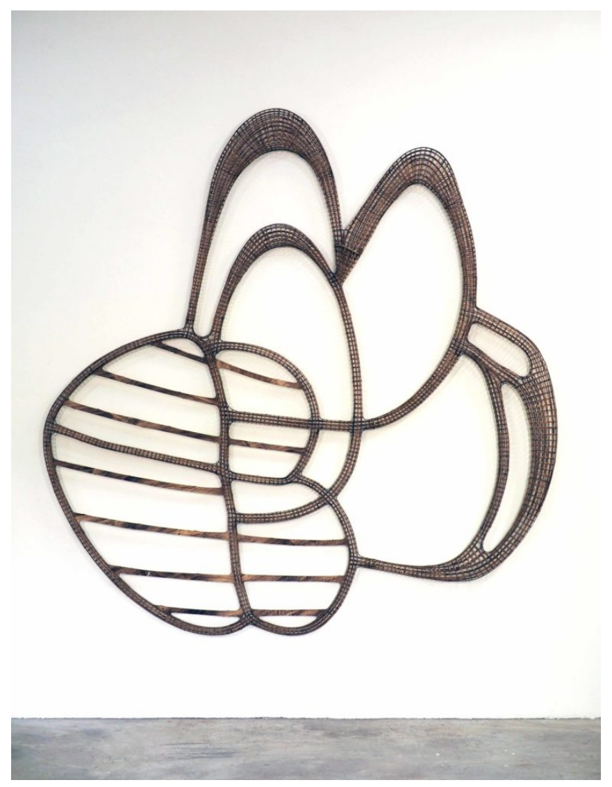
Sopheap Pich, Trenches 2 (2019).

" Sopheap Pich: The World Outside " at Tyler Rollins Fine Art March 7–April 19