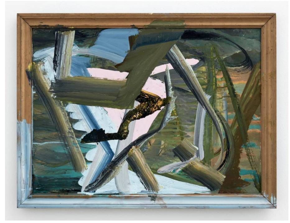
Katy Moran, DC 2 (2018).

" Katy Moran: I want to live in the afternoon of that day " at Sperone Westwater Through April 13