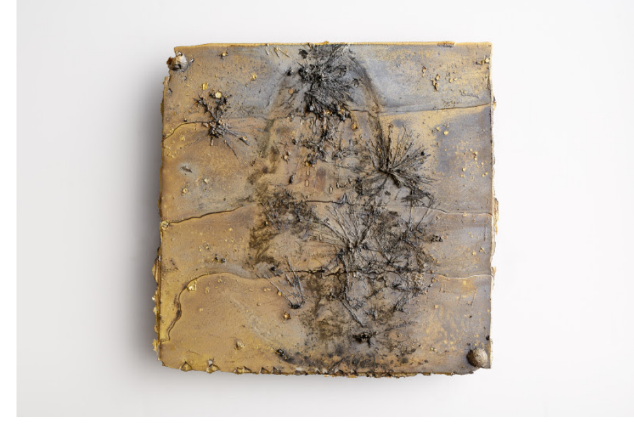
Shinji Turner-Yamamoto, Pentimenti: Strata #14 (2018)

" Microcosm & Macrocosm: Shinji Turner-Yamamoto " at Sapar Contemporary March 7–April 13