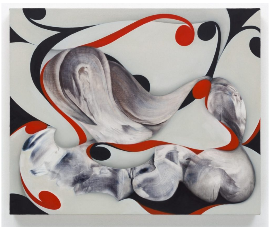
Lesley Vance, Untitled (2019).

" Lesley Vance " at Bortolami Gallery Through April 20