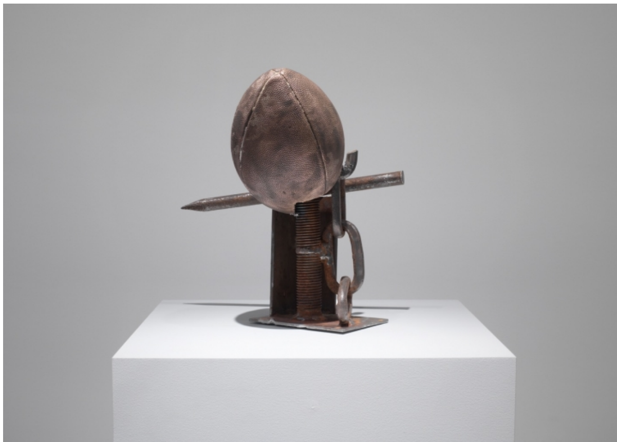
Melvin Edwards, "Goal Line Stance 2017" (2017) welded steel

Let's begin with a few anecdotes: Martellus Bennett, a National Football League player on the New England Patriots, claims that the NFL stands for "niggers for lease," arguing that management and league policies take advantage of players. During the past season's on-field protests (initiated by Colin Kaepernick) of the consistent and concerted