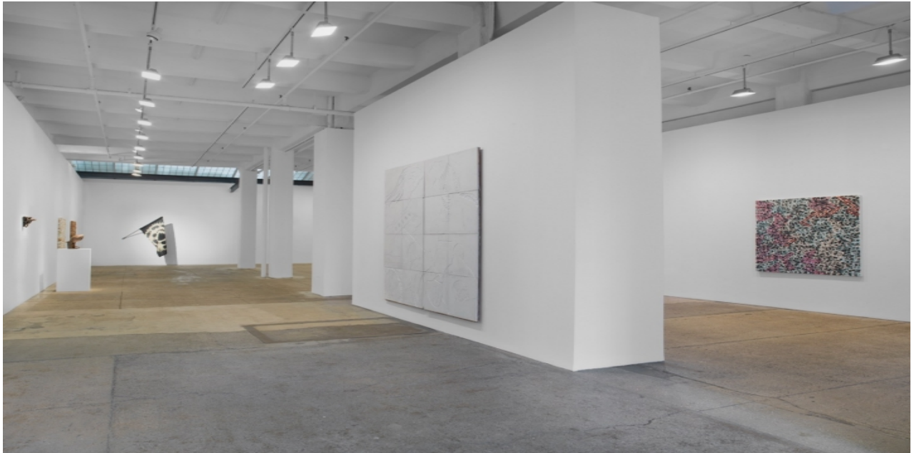
Installation view of Sidelined at Galerie Lelong

how much they are paid — typically by a class of men and women who wear suits.