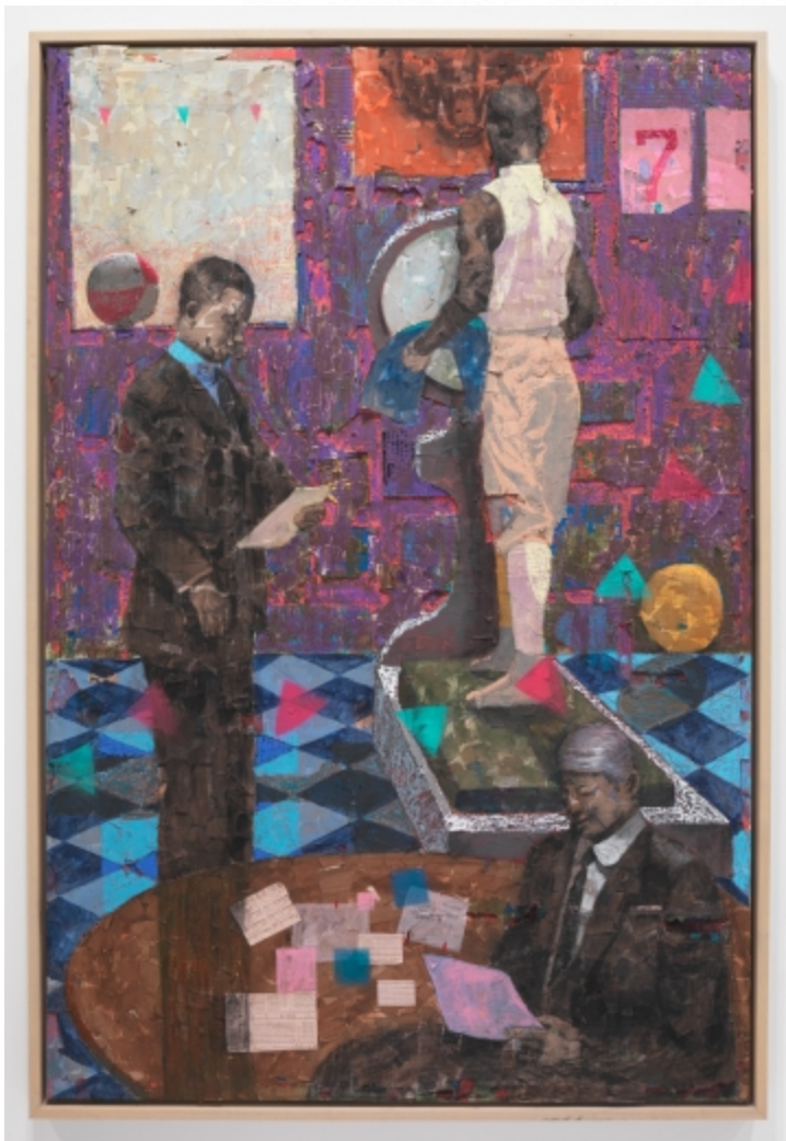
Derek Fordjour, “Numbers” (2017) acrylic, charcoal, and oil pastel on newspaper mounted on canvas

The exhibition Sidelined , curated by Samuel Levi Jones (who himself played football in college) at Galerie Lelong, makes us look at how these black men’s bodies take on weight and are grounded in meaning through a range of significations. In the brightly colored acrylic, charcoal, and oil pastel image “Numbers” (2017) by Derek Fordjour, an athlete weighs himself in a room in which men in suits peruse information on sheets of paper. The celebratory palette of the work belies the stark distinctions levied by numerical values: weight, height, age, how fast one runs the 40-yard dash. Athletes’ bodies are unceasingly measured and judged. Their statistics are cumulatively valued to help determine