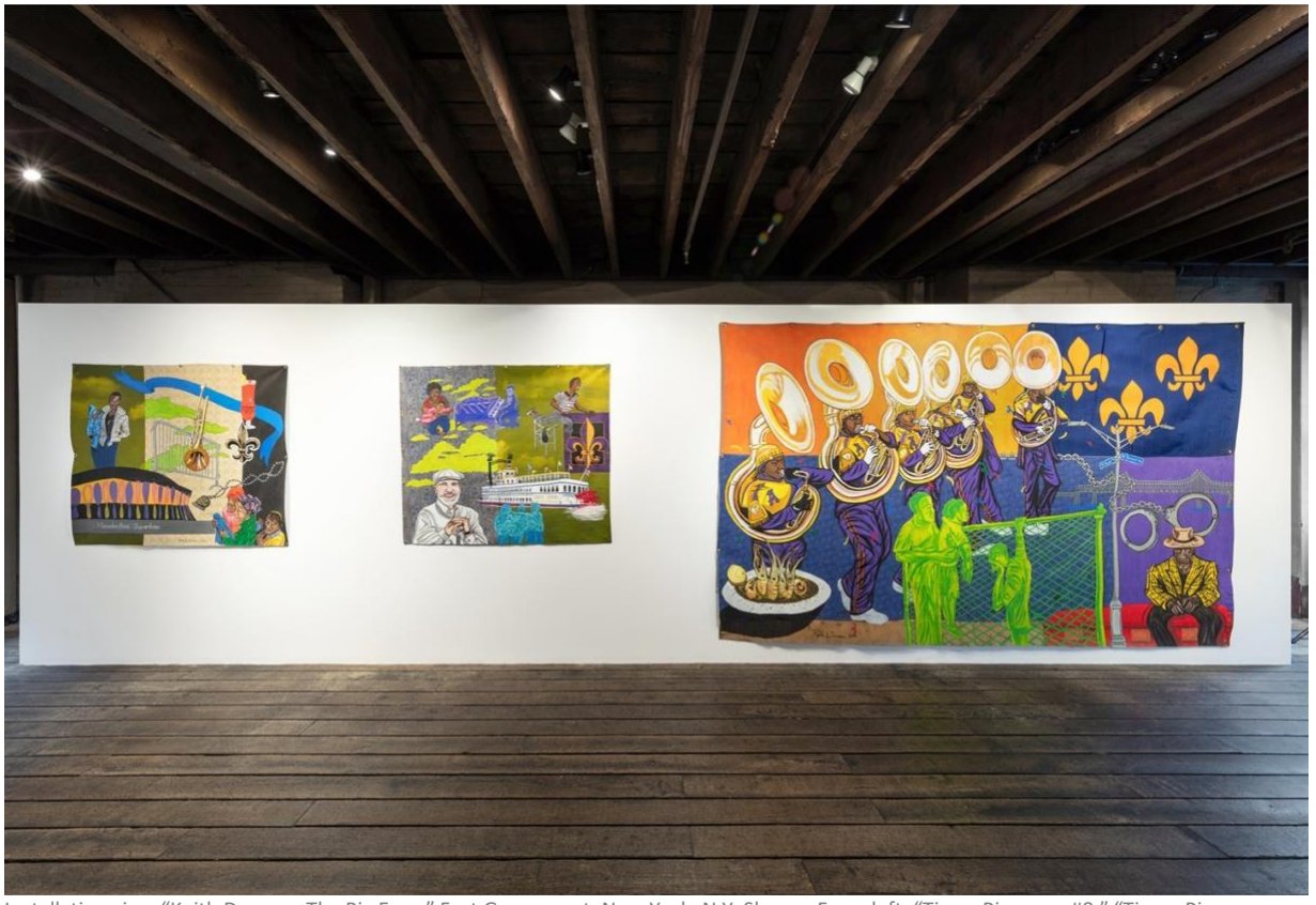
Installation view "Keith Duncan: The Big Easy," Fort Gansevoort, New York, N.Y. Shown, From left, "Times Picayune #8," "Times Picayune #7," Majestic Messengers."

With illustrations by Willie Birch, "Roll With It: Brass Bands in the Streets of New Orleans" offers "a firsthand account of the precarious lives of brass band musicians in New Orleans. These young men are celebrated as cultural icons for upholding the proud traditions of the jazz funeral and the second line parade, yet they remain subject to the perils of poverty, racial marginalization, and urban violence..." Recently published, "Freedom's Dance: Social Aid and Pleasure Clubs in New Orleans," documents one of most prominent cultural traditions in New Orleans.