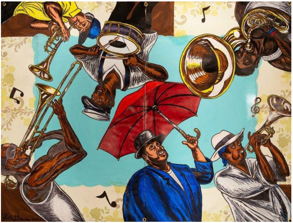
KEITH DUNCAN, "The Second Line #1," 2010-11 (acrylic on paper, 36 x 48).