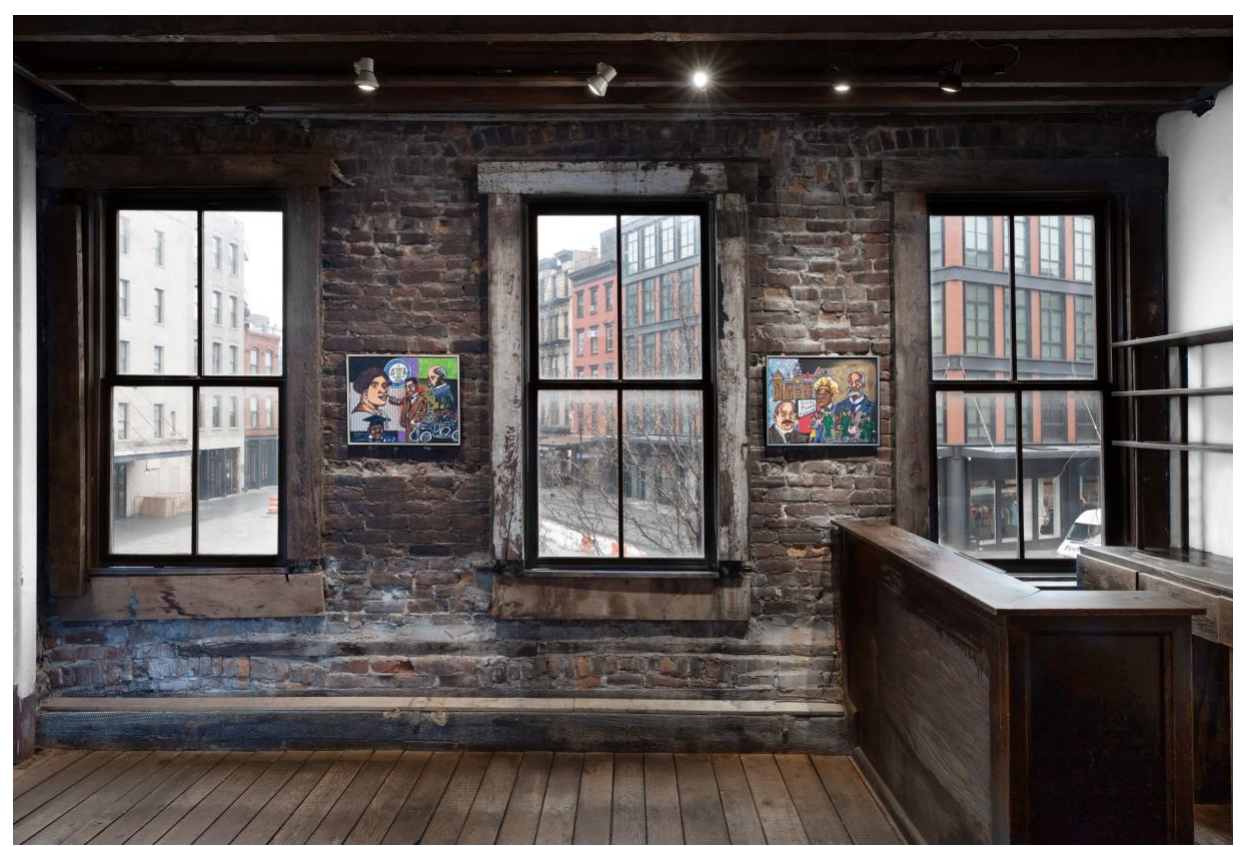
Installation view "Keith Duncan: The Big Easy," Fort Gansevoort, New York, N.Y. Shown, "Reconstruction Era" and "Black Inventors and Entrepreneurs Era."