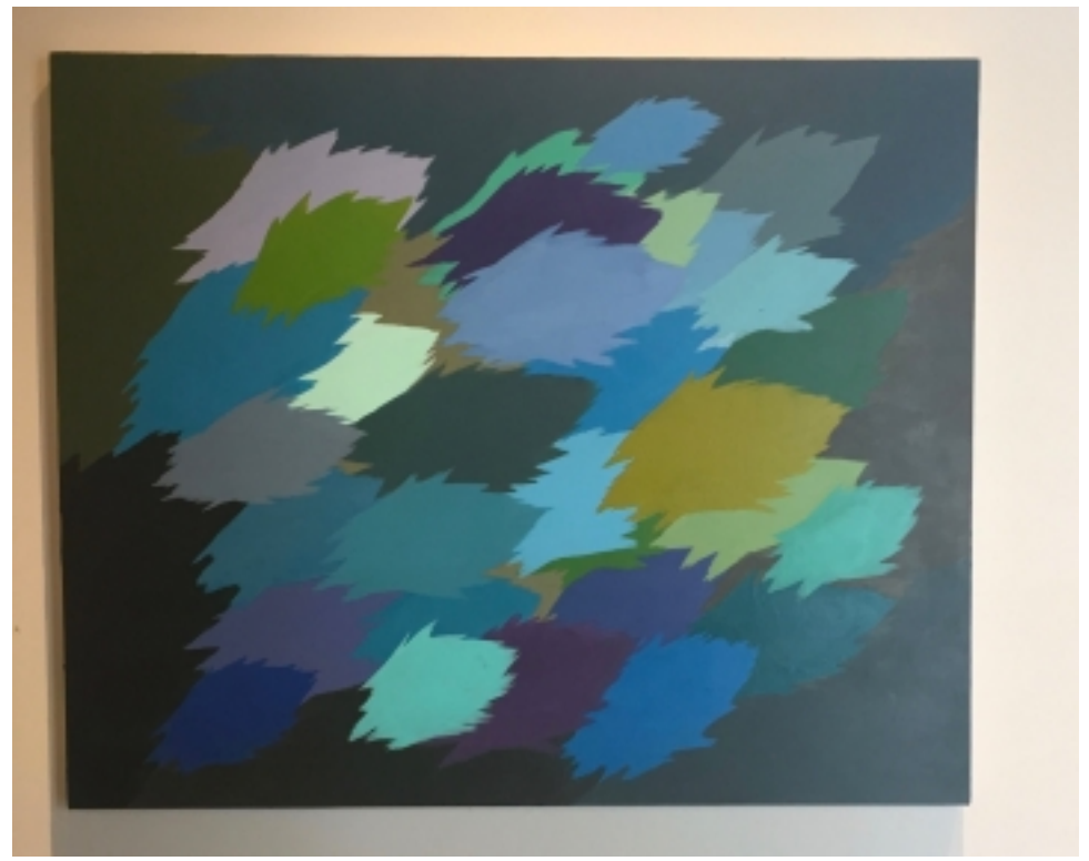
Edgar Heap of Birds, "Nuance of the Sky", Neuf Series, 2012, acrylic on canvas

Also included in the exhibit are Heap of Birds's "Neuf" paintings, which at first seem like anomalies. These abstract landscapes don't contain texts, as Heap of Birds's other works do. Instead, they convey the poetry of the hues and color of the land. In his book about the artist, Anthes notes that these landscapes don't contain a horizon line or perspective: tools for colonization in the view of some Native theorists. Instead, Heap of Birds inserts viewers into the land itself, surrounding them, demonstrating what it means to be a part of the land, rather than mapping it to conquer it. The paintings are meditative and serene, but share a political message with Heap of Birds's other work.