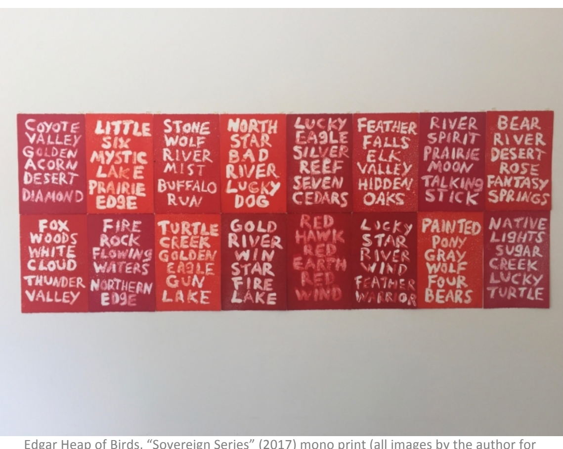
Edgar Heap of Birds, "Sovereign Series" (2017) mono print

MINNEAPOLIS — The Bockley Gallery currently has on view a mini-retrospective of the work of Edgar Heap of Birds (whose Cheyenne name is Hock E Aye VI), which contains examples of different bodies of work the Cheyenne/Arapaho artist has created over his extensive career. With public art pieces, biting political, text-based work, and more intimate abstract paintings,