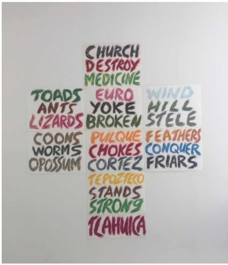
Edgar Heap of Birds, "Cross for Tepoztlan", (2009) pastel on paper

And then at the bottom, printed in larger letters is "LIVING PEOPLE." Around the text are black smudges, abstractions of black birds in flight. The stark poem calls out the commercialized primitivism that is pervasive across American Society — in sports team insignia or Land O' Lakes butter which use stereotypical images of Native Americans, that are divorced from contemporary life.