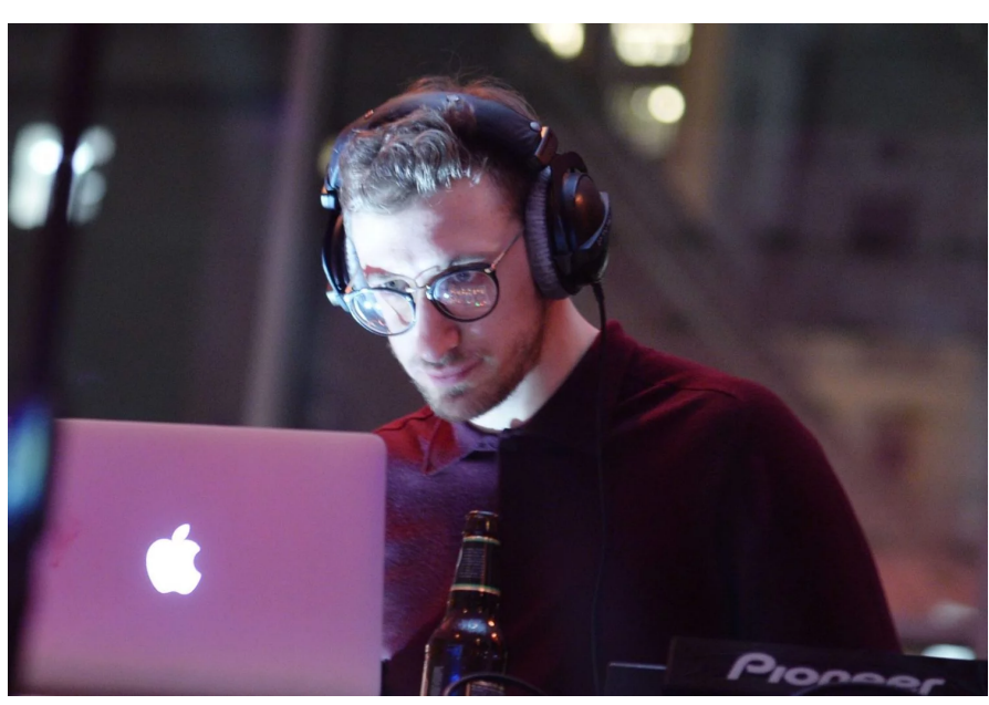
Monday, November 21

Each week, we search New York City for the most exciting, and thought-provoking, shows, screenings, and events. See them below.