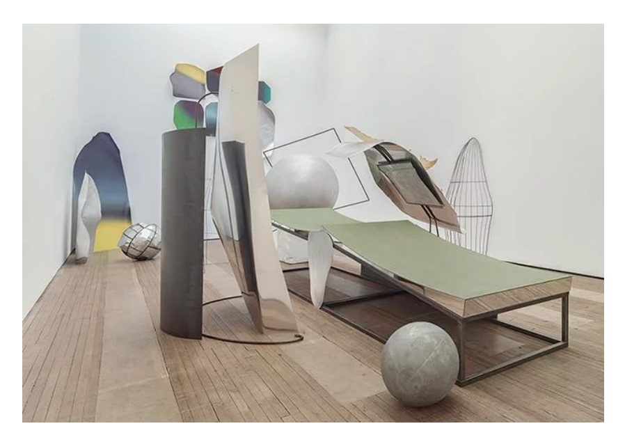
Liu Wei, Transparent Land (2016).

Miami is on everyone's minds, but New York still has a lot to offer right now. artnet News (https://news.artnet.com/about/artnet-news-39), November 21, 2016