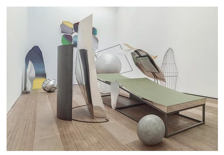
Liu Wei, Transparent Land (2016).