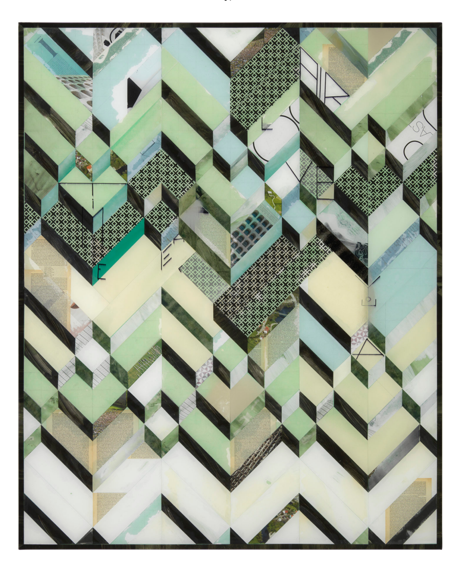
Until Saturday, December 17