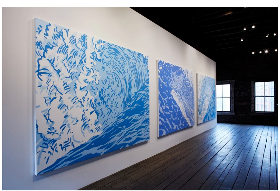
Installation view of Roy Fowler, "New Wave" at Fort Gansevoort Gallery.