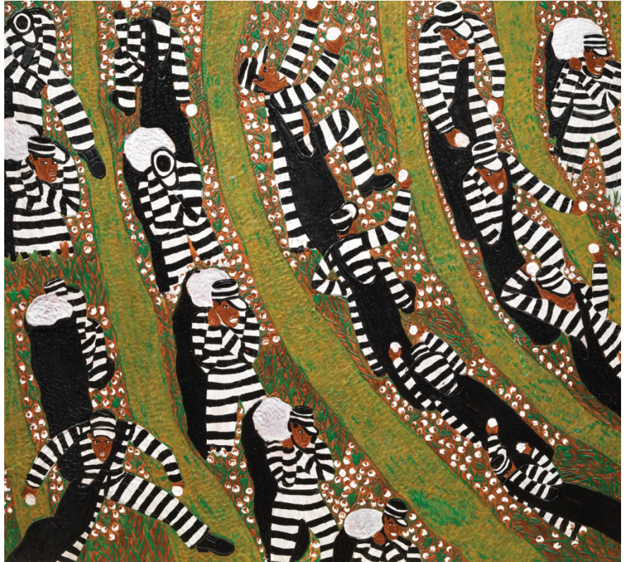
"Chain Gang Picking Cotton" (2011). "The cotton field is tough. They had you in slavery-like situation."

"All Me"—that's how I painted it. Each person in the picture has a role to play. I didn't want to play any of the parts, but I had to be somebody. I couldn't walk around and be nobody, so I became all of them. It's like I was more than one person inside myself. In fact, I think if I hadn't decided to play the all me role on the chain gang I wouldn't have made it. Taking that stance all me —saved me. Everybody thought I was crazy. The guards and the inmates, too: That nigger crazy! One thing is for sure—when inmates think you're crazy, you can survive. They won't mess with you. And when officials think you're crazy, you'll never go to the sweatbox.