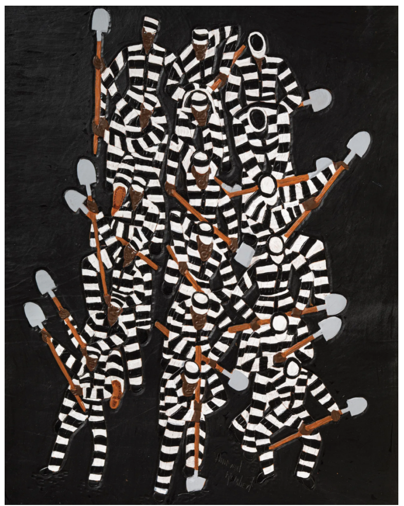
"Chain Gang-The Ditch" (2008). "You can't make the chain gang look good in any way besides by putting it in art."

I understand that seeing that word written flat out on the page may hurt some people. My hope is that they will come to understand why it's there. As a young person, I was called a nigger so many times I answered to it like it was nothing. That's what happened. My story will not be as clear if I block out the word or even change a single letter. A substitute doesn't carry the same effect. To me, that means it isn't the same word. I've got to use the word just like I've heard it said so many times in my life. I think about all the people who went to their graves because they didn't want to be called a nigger. Some people died because they wouldn't put up with it. They were killed. I want the reader to understand the effect it carries when you use that word and how degrading it is. I want to tell about how being called that affected me, and I want the reader to understand the was not so long ago.