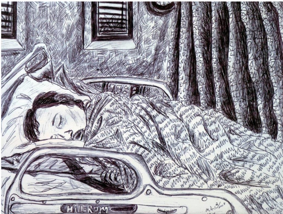
"Untitled," 2008.