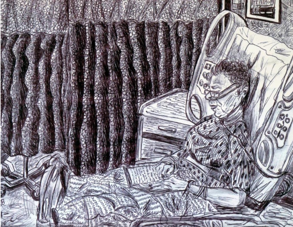
"Untitled," 2008.