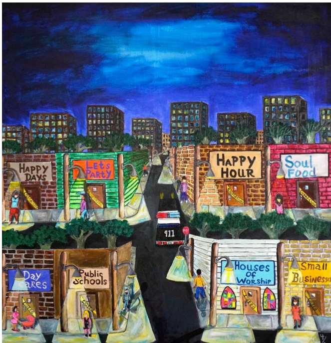
"Social Distancing," 2020.

She praised his paintings as "vibrant and prismatically structured."