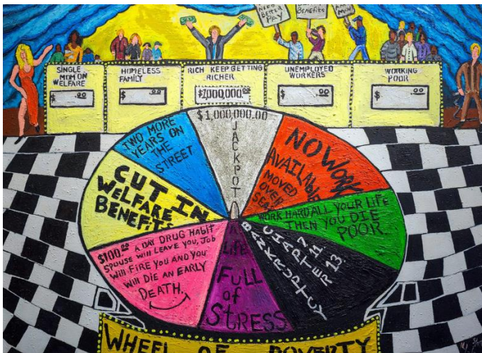
"Wheel of Poverty" 1997.