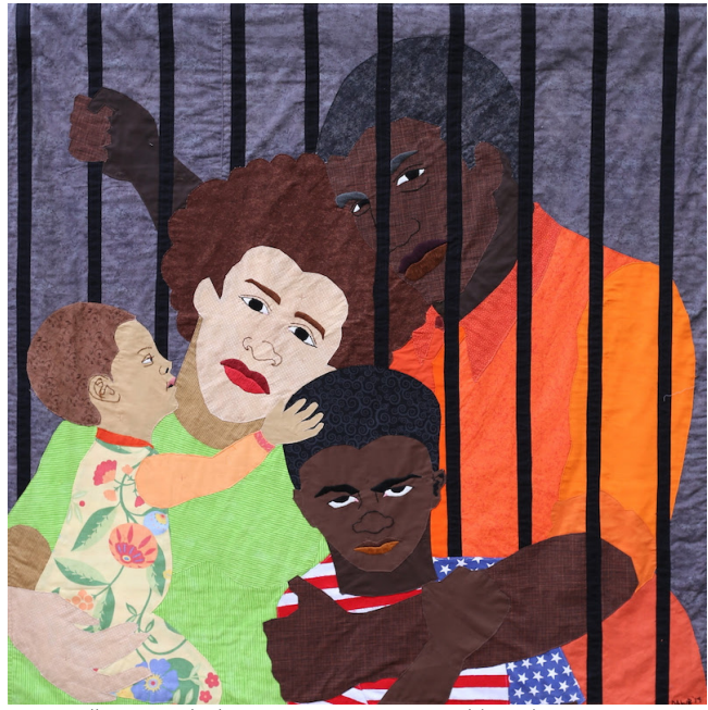
Dawn Williams Boyd, The Trump Era: Incarcerated (2019).

For the artist, showing at universities is an opportunity to inspire young people. For Shopkorn, strong relationships with regional museums are "the crux of Fort Gansevoort. They don't have to jump through as many hoops as these bigger institutions to make things happen."