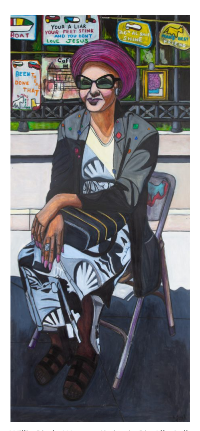
Willie Birch, Woman Sitting in Big Al's Gallery (1999).

"You have to take a risk, and sometimes it doesn't work," he said, expressing no regret.