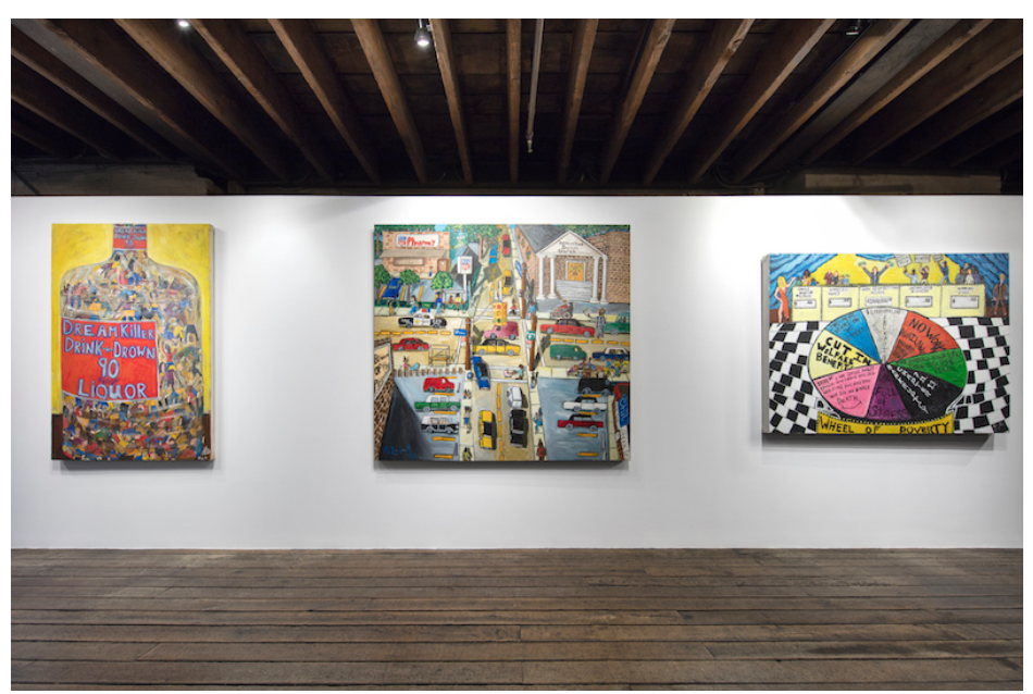
Installation view, Fort Gansevoort in New York City.