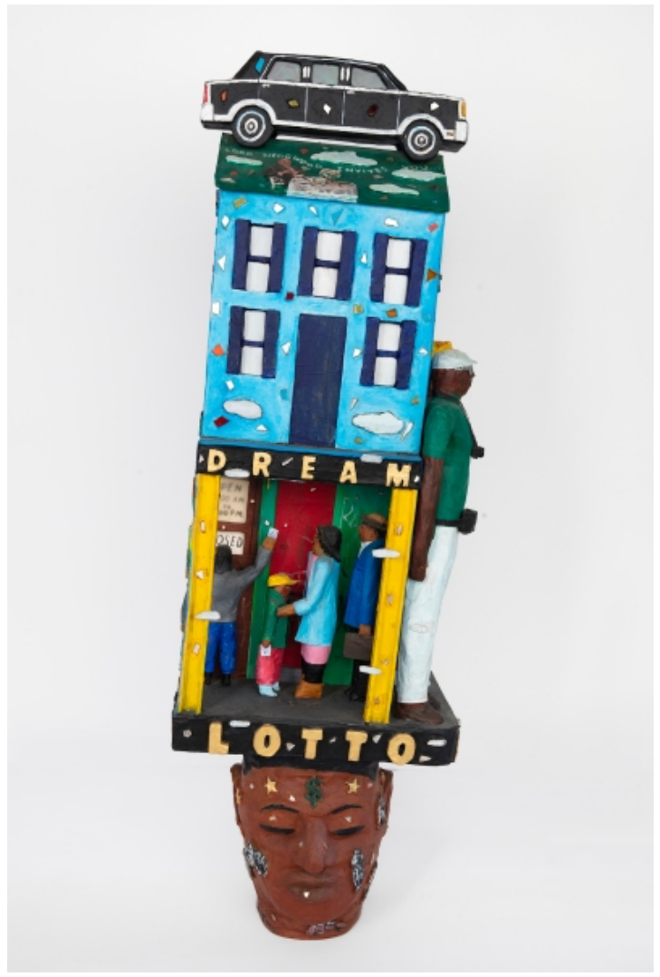
Willie Birch, Lotto Dreams, 1994, Painted papier-mâché, mixed media, 57 \times 20 \times 15 inches. ©Willie Birch. Courtesy the artist and Fort Gansevoort, New York.