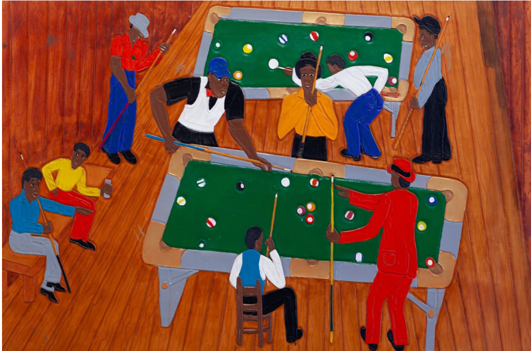
WINFRED REMBERT, "Jeff's Pool Room," 2003 (dye on carved and tooled leather, 59.1 x 88.9 cm / 23 1/4 x 35 inches). I © 2023 The Estate of Winfred Rembert/ARS NY, Courtesy the artist, Fort Gansevoort, and Hauser & Wirth

10 locations in New York, Los Angeles, Hong Kong, and Europe began representing the artist's estate in collaboration with Fort Gansevoort, a rare feat for a self-taught contemporary artist.