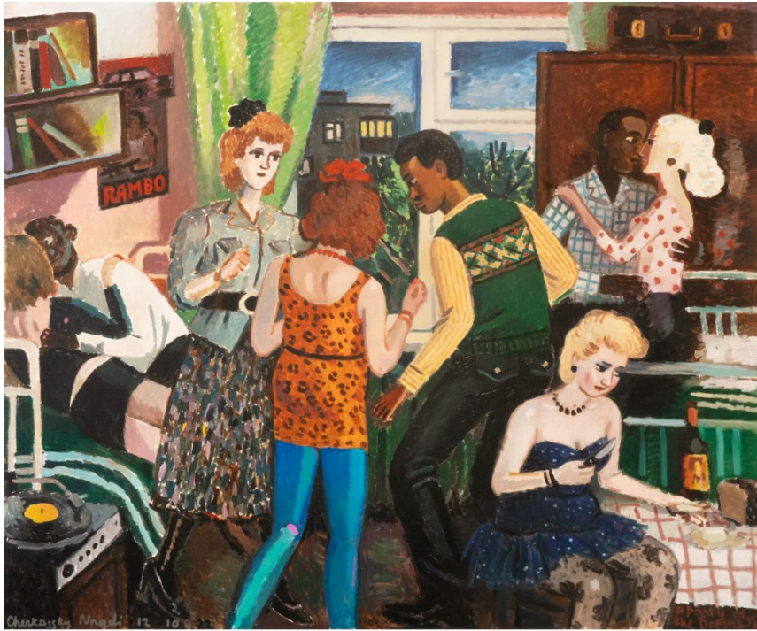
Zoya Cherkassky, Party at the Dorms (2022).