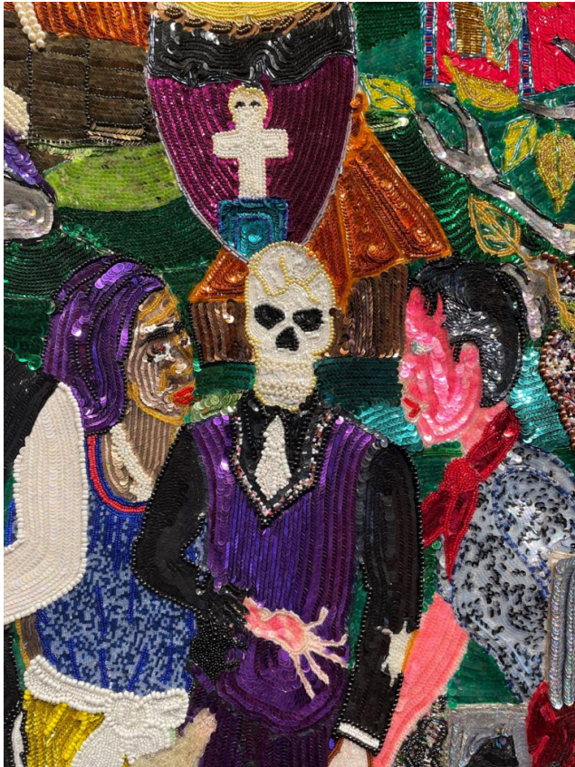
Reincarnation Des Morts, detail, 110 x 111 inches. Beads, sequins, tassels on fabric. 2022

I love the way that Constant embroiders the landscape and sky behind the figures. The picture plane is flat, moving us from below the earth to the sky. Nothing is static in this piece. The dynamic swirl of the lives of the spirits is reflected in the dynamism of the textile. The work has an affinity to painting that is unusual in this field. Vodou banners were traditionally made by men and typically more static in their portrayal of the world. Constant brings both a mastery of the craft and a mastery of composition to this body of work.