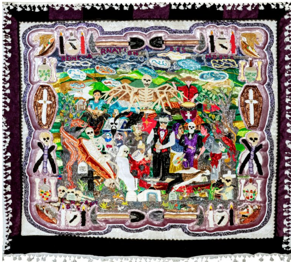
Reincarnation Des Morts 110 x 111 inchex. Beads, sequins, tassels on fabric. 2022.

Fort Gansevoort Gallery in New York's Meatpacking District has long been one of my favorite galleries. Housed in an old three-story building, they have been presenting some of the freshest and most original shows in the city. The current exhibition, Myrlande Constant: Drapo is one of their best. Constant is a Haitian artist who works in textiles, taking a traditional form called "drapo" and rocketing it into the realm of contemporary art. Drapo is based on a 19th century embroidery technique developed in France, called tambour. Fabric is stretched tautly over a wooden frame and embroidery, using sequins and beads done from the reverse side.