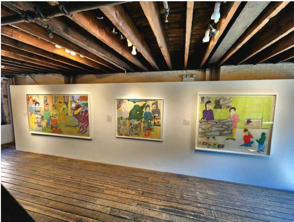
Installation view of Shuvinai Ashoona's enormous drawings on the second floor at Fort Gansevoort