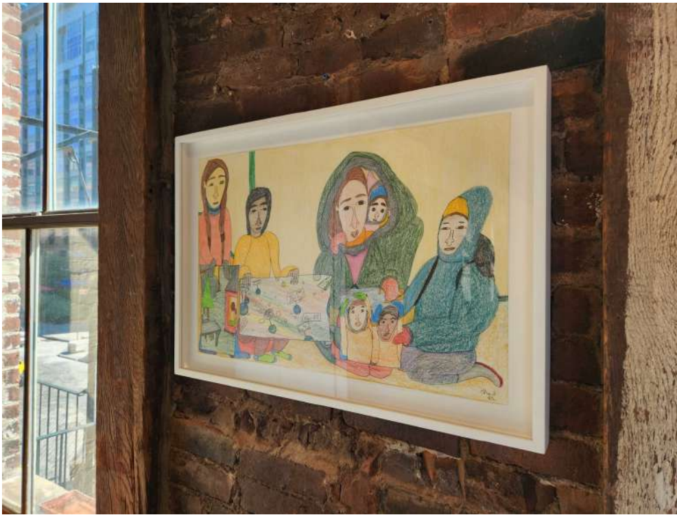
An installation view of Shuvinai Ashoona's "Untitled" (2023), ink and colored pencil on paper, 15 x 23 inches, on the second floor at Fort Gansevoort