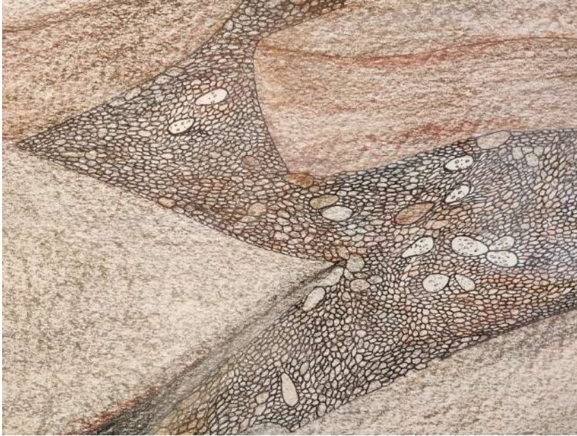
Detail of Shuvinaï Ashoona's "Eggs and Rocks" (2023), a colored pencil and ink drawing on paper showing a rocky landscape populated by native birds

Spread across three gallery floors, Ashoona's compositions celebrate and document contemporary Inuit existence and perseverance in juxtaposition with pre-colonial traditions that have been threatened by the modern environmental consequences of capitalism and colonialism. These explosions of color and carefully mapped spatial dynamics narrate the artist's enthusiasm for life and its truths, in all their harshness and beauty.