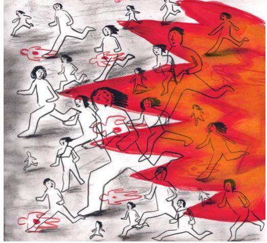
Victims Running by Rotem Codish

Among the many new projects to have emerged are street theatre, graffiti, street art, and tattooing.