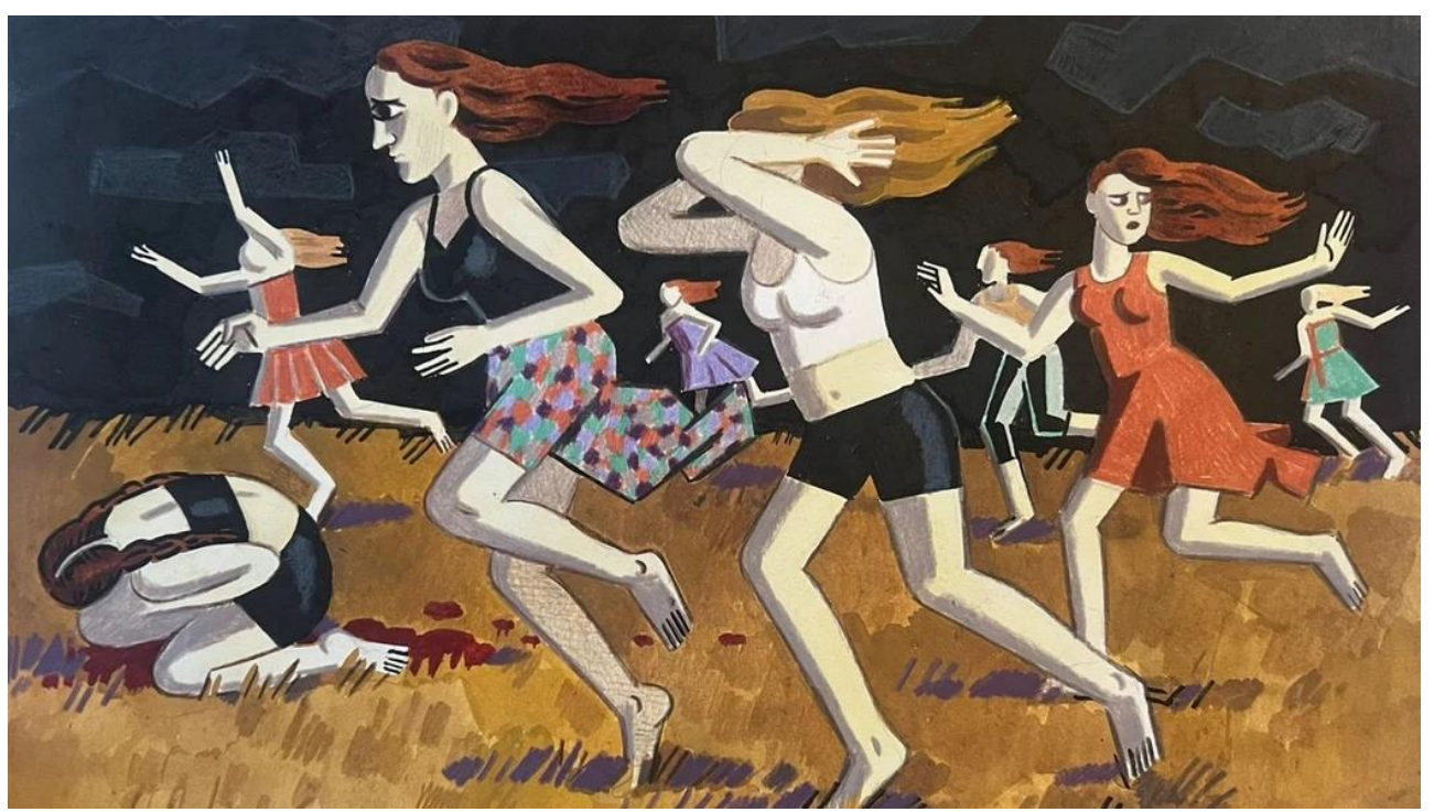
'The Terrorist Attack at Nova Music Festival' by Zoya Cherkassky, October 2023.

The Hamas attacks prompted an outpouring of creativity in Israel from painters and illustrators, professional and amateur alike By Elisa Bray – November 23, 2023