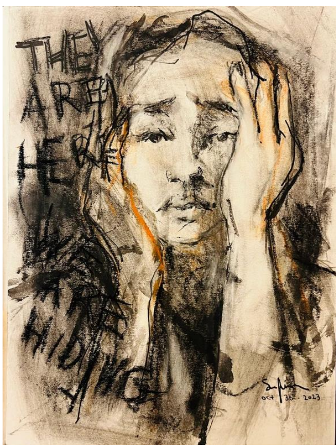
Let My Children Go artwork by Safira Klein

She invited "everybody everywhere" to create art inspired by each child hostage and upload it for the world to see. On the website there are photographs of all the child hostages with a written profile detailing their hobbies and favourite foods, and with artworks created just for them.