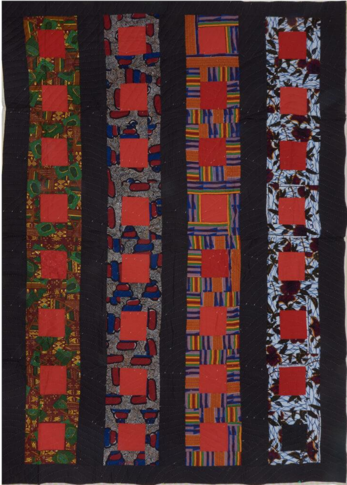
Yvonne Wells African-American 1994